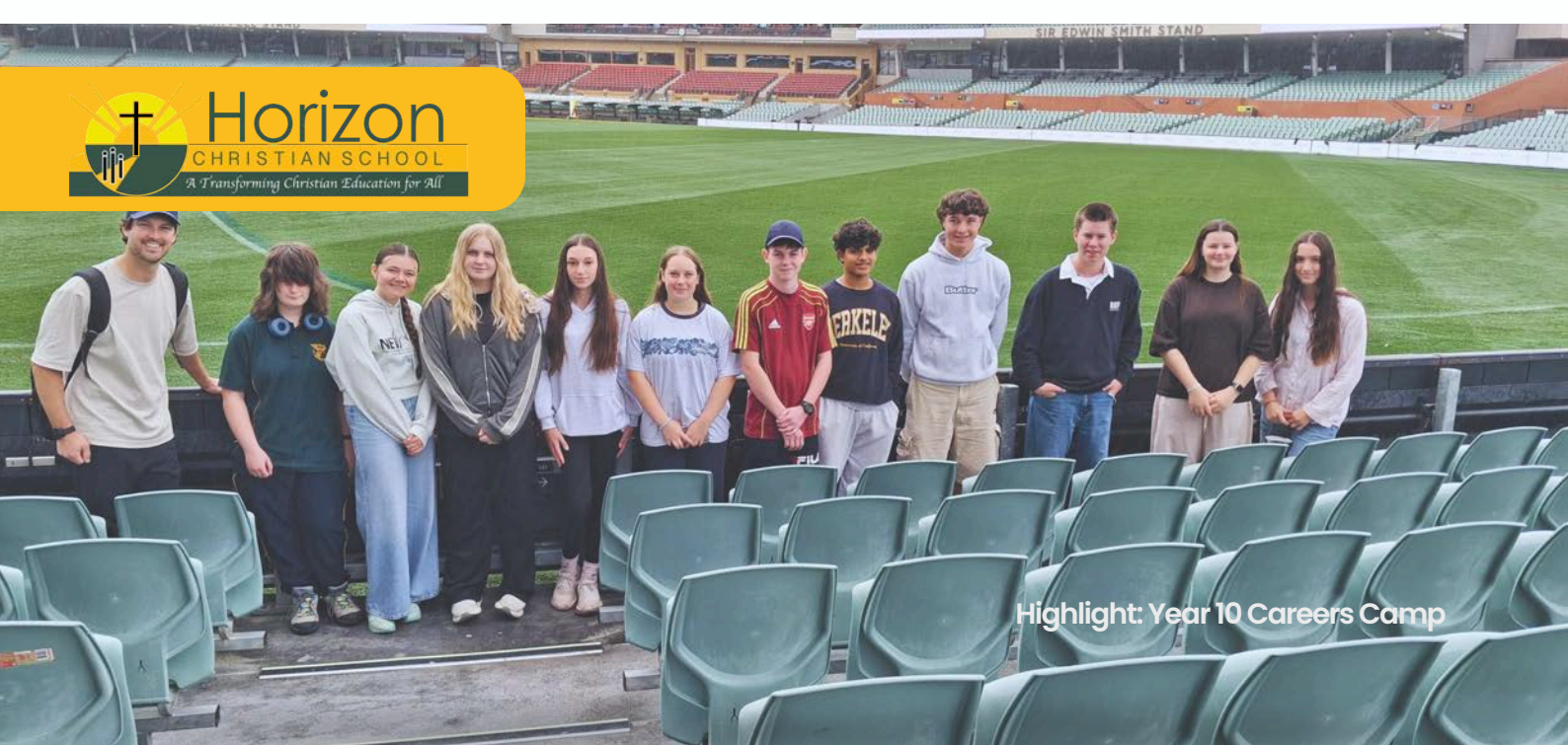
Highlight: Year 10 Careers Camp