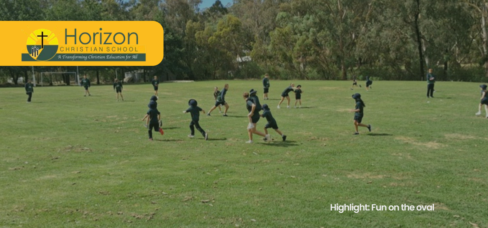
Highlight: Fun on the oval