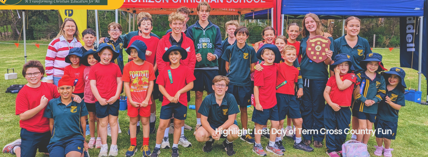
Highlight: Last Day of Term Cross Country Fun