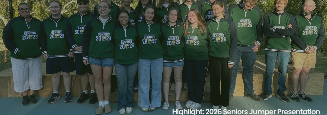
Highlight: 2026 Seniors Jumper Presentation