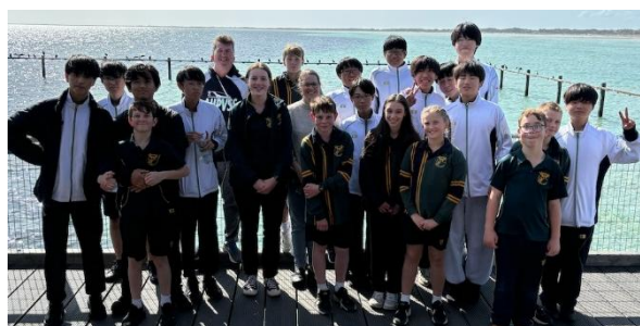
(2024 Japanese students and Horizon billets)

given to ensure a smooth and enjoyable experience for everyone involved. If you are interested in opening your home and heart to one of our visiting students, or if you would like more information, please contact the school office as soon as possible.